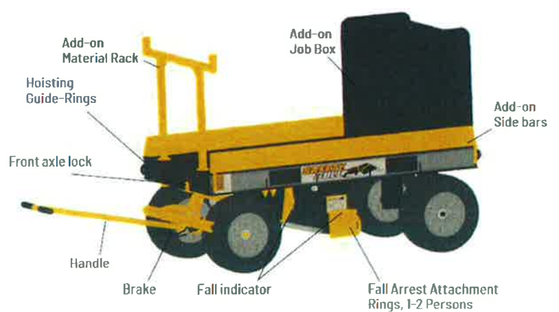
Principle drawings of SafetyBull - Mobile anchor point integrated in a cart