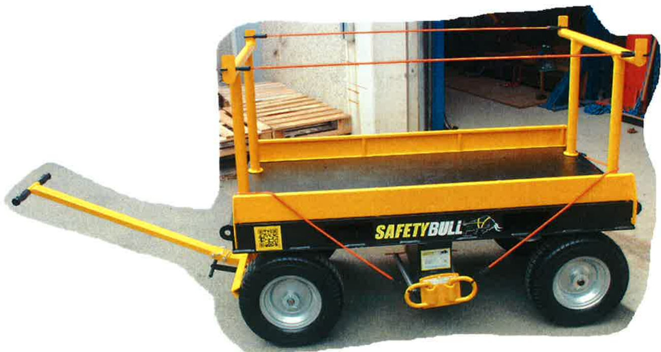
Photo of SafetyBull - Mobile anchor point integrated in a cart