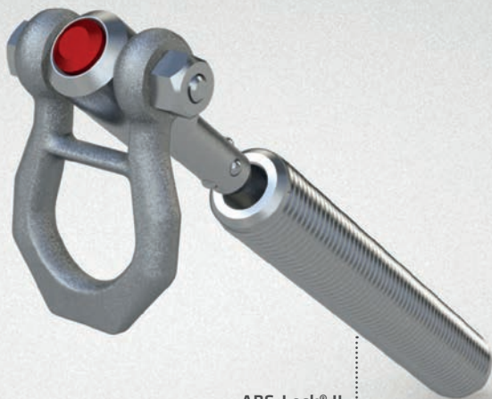
ABS-Lock® II L2-X-XXX