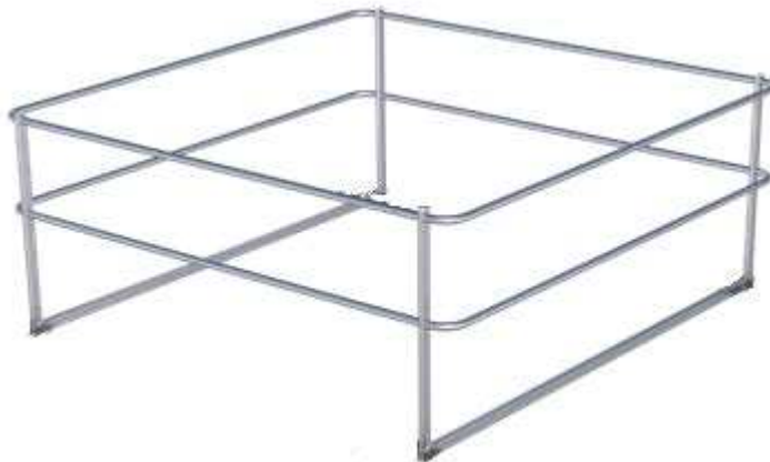
Fig. 12: Installation variant of the side protection system, type: Dome onTop Fusion