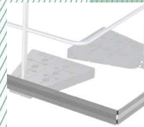
Fig. 11: toe board