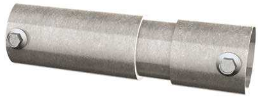
Fig. 6: rail connector II