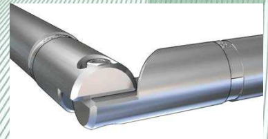
Fig. 8: joint