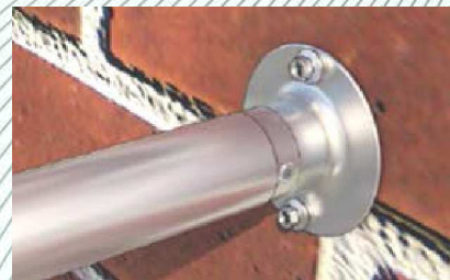
Fig. 10: rail with flange for wall mounting