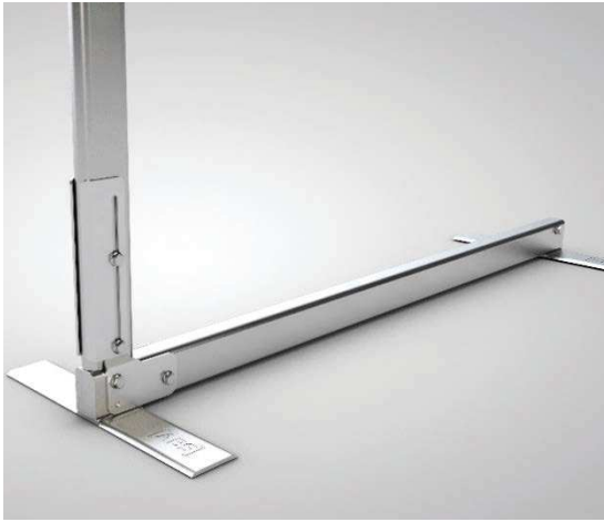
Fig. 2: post with cantilever and long slots in connecting angle