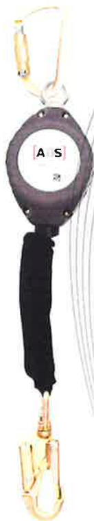
Fig. 1: Retractable type fall arrester, ABS B-Lock 3.5 m

The retractable type fall arrester of type ABS B-Lock is also suitable for the use in horizontal positions and a fall resulting from that over and edge with a maximum radius of max. r = 0.5 mm.