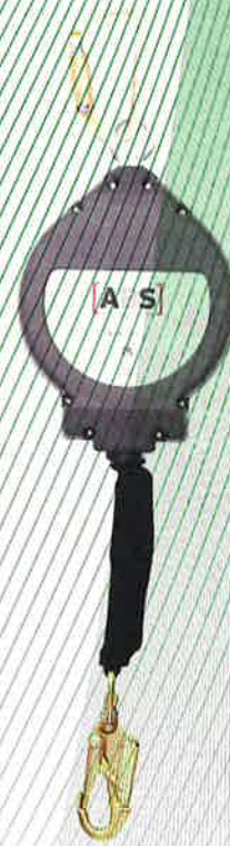
Fig. 3: F Retractable type fall arrester, ABS B-Lock 12 m