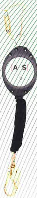
Fig. 2: Retractable type fall arrester, ABS B-Lock 6 m