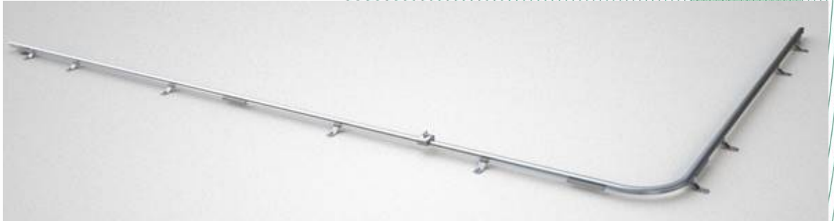
Fig. 1: Anchor device, type ABS AluTrax (assembly examples)

The anchor device is made of corrosion-resistant material.