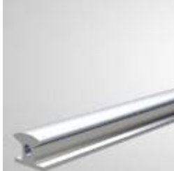
Fig. 2: Anchor line