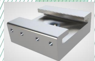
Fig. 4: Bracket