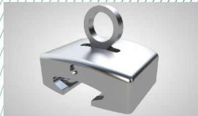
Fig. 3: Mobile anchor point, type ABS AluTrax Roll