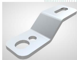
Fig. 5: Angle