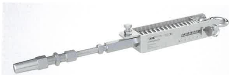
Fig. 4: tensioning device, type CompactForce