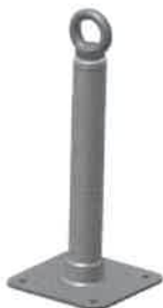
Fig. 3: ABS-Lock ® X-SR