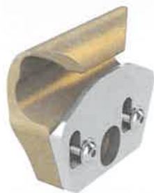
Fig. 1: mobile anchor point, type UniGlide

The tensioning device with rope force display of type CompactForce (Fig. 4) is used to pre-tension the anchor line.