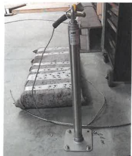
Fig. 5-6: details of test layout