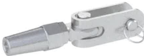
Fig. 2: end connector